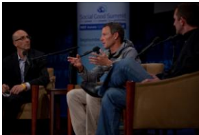
Speaking at UN Foundation media summit