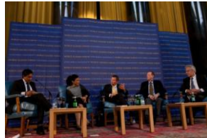
Panel at Columbia University with Dr. Sanjay Gupta and global health leaders