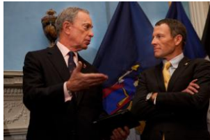
Event with New York City and Mayor Bloomberg

Promoting multi-sector awareness and action