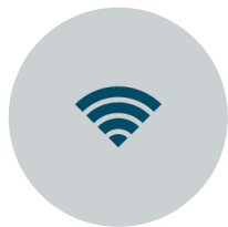
HIGH SPEED INTERNET