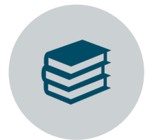
EDUCATION AND LITERACY